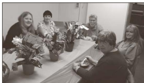
DSPs from Lake and Ashtabula counties enjoy the Ice Cream Social.

While our DSPs enjoyed an Old-fashioned Ice Cream Social, Administrative Team members washed their cars.